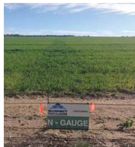
Summit Fertilizers has pioneered Fuel Gauges and N-rich strips for growers as part of its productivity package.

“The level of understanding of the person setting up each tool also directly impacted on how accurately the model replicated the real world environment. The more simple tools appear to be suited to grower set-up and the more complex ones are probably better used with advisers – or adviser and grower collaboration – to be reliable and robust.”